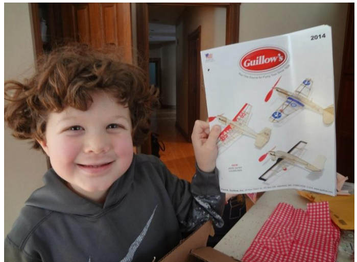
Happily surprised with what he found inside the box.